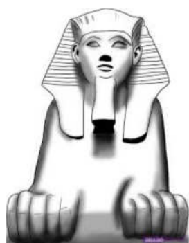
The perfect bridge player

Dear Puzzled, unlike poker in which all sorts of mannerisms, misleading statements and bluff tactics are part and parcel of the game, bridge is supposed to be played with a 'pokerface'. I urge to all to channel your inner Sphinx and stop the flow of information that can assist your partner.